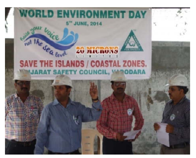
Induction on subject of Climate change

World Environment Day is an annual event that is aimed at being the biggest and most widely celebrated global day for positive environmental action. On the occasion we have more than 500 trees plantation and conducted awareness programme on our plant.