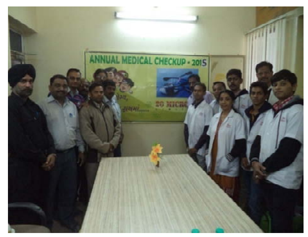
Health Check up was started with warm welcome to the medical team