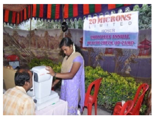
Eye test examining by the medical staff