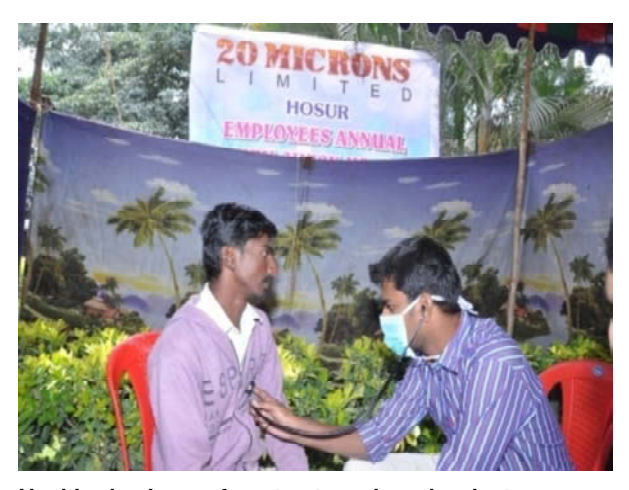
Health check up of contractors done by doctor