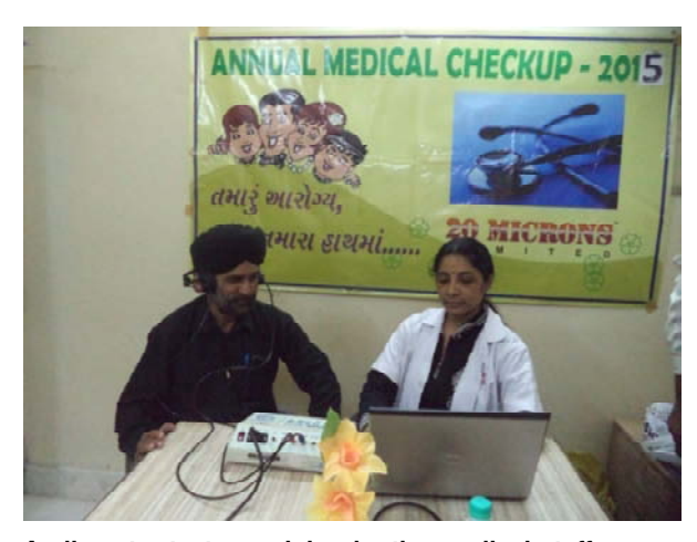
Audiometry test examining by the medical staff