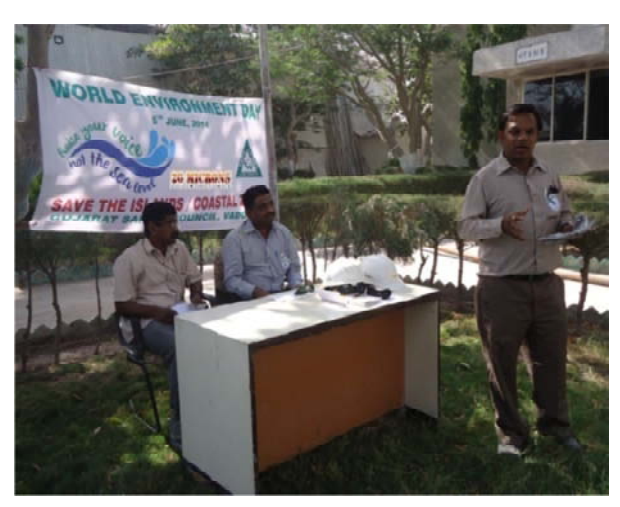
Awareness of environment and save trees